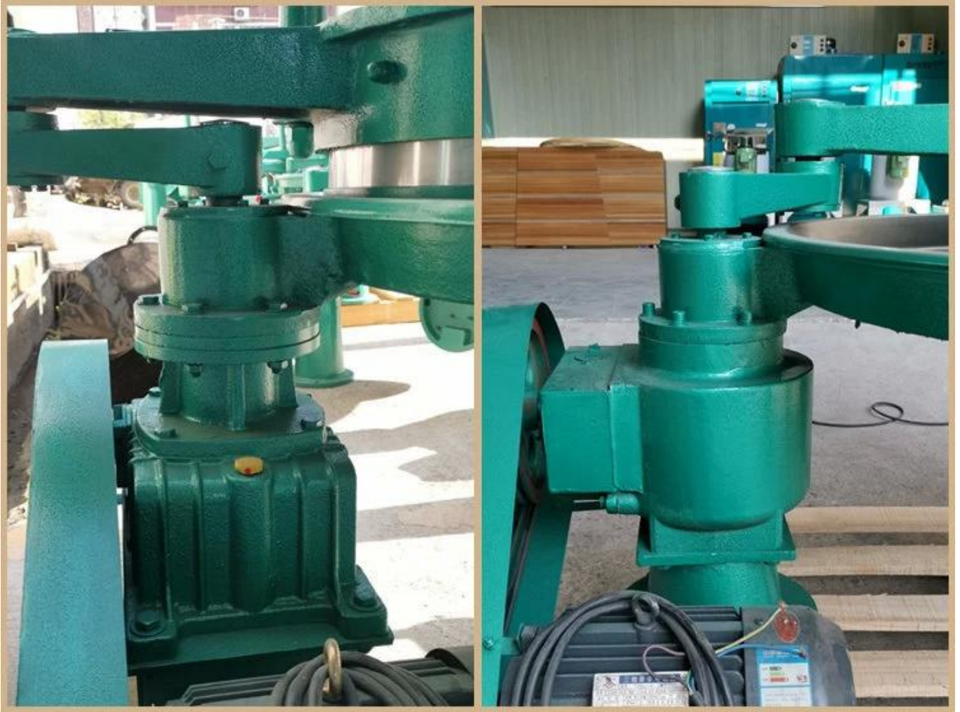
Turbine worm gearbox design, deceleration is stable and durable.