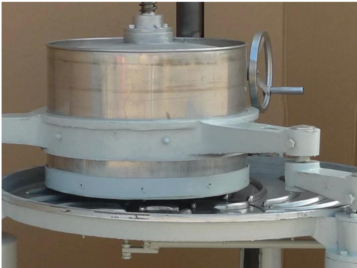
DL-6CRT-45 tea leaf kneading machine made of food grade stainless steel, capacity about 15 kg per batch, for rolling green tea about 15-150 kg per hour, for black tea can roll about 15-30 kg per hour.